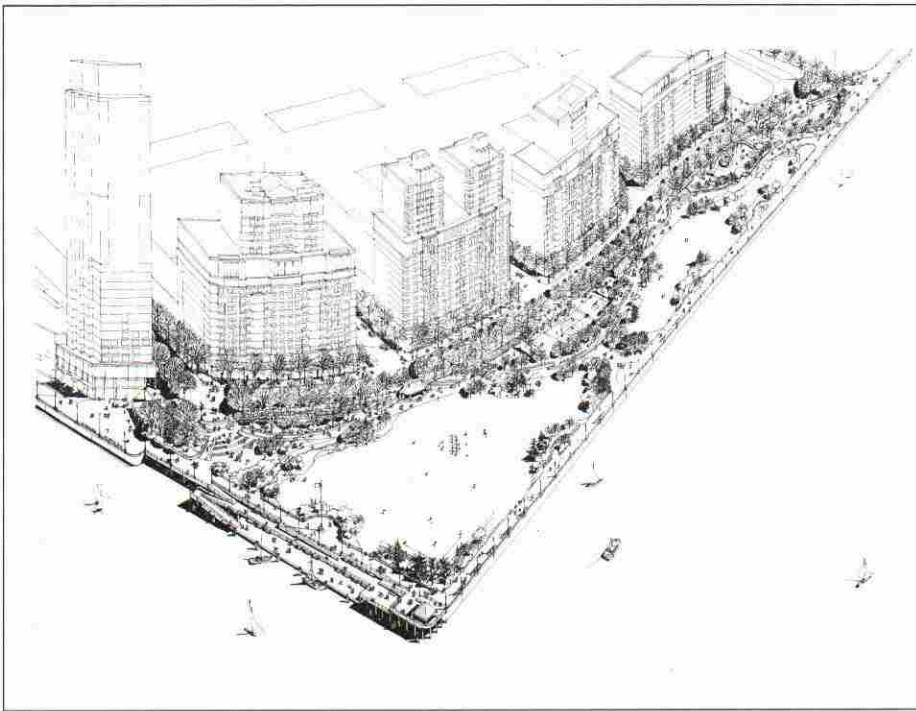
Plan graphics drawn to scale can be a useful part of case studies. The North Park at Battery Park City (Carr, Lynch, Hack and Sandell).