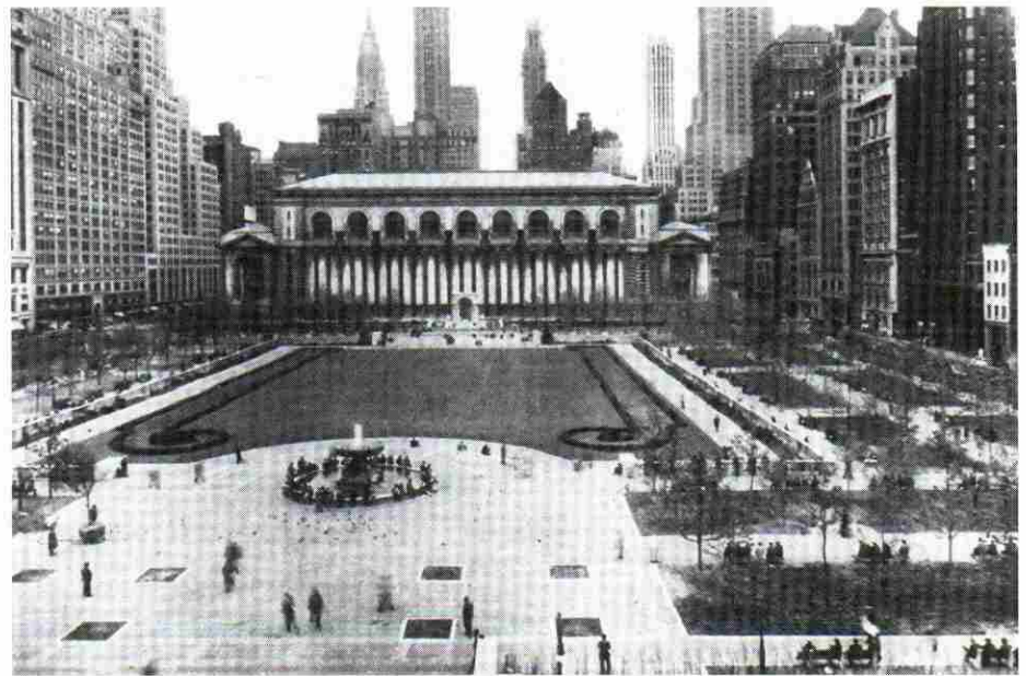
Early photo of Bryant Park, New York City.

Genesis of the Project. The recent redevelopment of Bryant Park grew out of significant social and crime problems within the park, especially during the 1970s. To redevelop the park, the BPRC, a private nonprofit group funded primarily by corporations located near the park and the