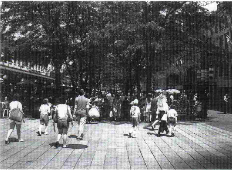
Boston's Faneuil Hall is an example of an urban landscape that has been developed as a case study.

nomics. In landscape architecture, the Contemporary Landscape Inquiry Project at the University of Toronto's Virtual Landscape Architecture Library Web site includes over 160 project case studies in landscape architecture maintained by landscape architecture faculty and students. The site includes case studies of varying lengths and qualities, a case study search engine, and a way to make available new case studies online.