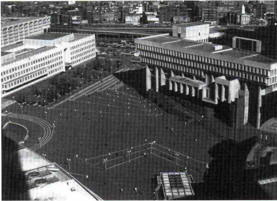
Case studies can be useful in redesigning existing projects such as currently is the case in the redesign of Boston's City Hall Plaza.

of use of the park by the sociologist William Whyte (1979). Landscape architect Laurie Olin conducted detailed sketches, site analysis, and redesign studies of the park in the 1980s. 18 Several economic studies were done on the importance and redevelopment of the park during that same period.