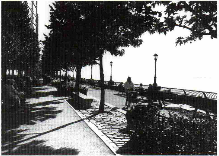
The Promenade at New York City's Battery Park City.

Criticism. A body of criticism is essential for any profession to develop and advance. Case studies are a useful way to develop that body of criticism in landscape architecture. They can illuminate both the positive as well as the negative aspects of projects. Case studies can also inform ongoing intellectual debates and critical discussions within landscape architecture. Criticism is frequently