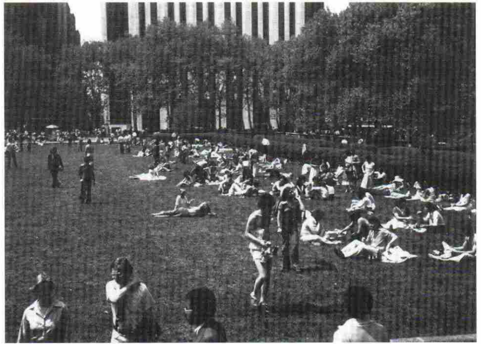
The central lawn area of Bryant Park in use before the park's renovation in the early 1990s.

Peer Reviews. Bryant Park has enjoyed a very favorable reception by