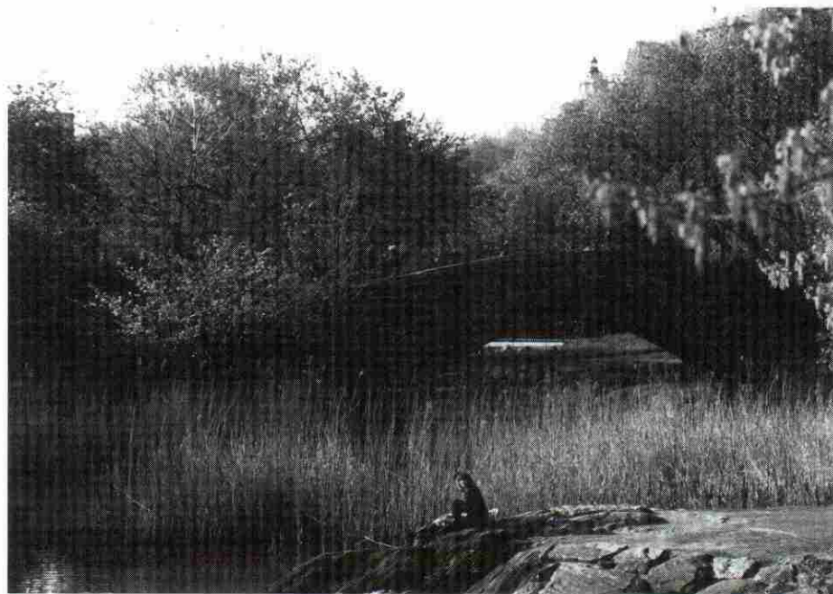
New York City's Central Park has been documented numerous times as a case study project.

lic policy all use case studies (Yin and the Rand Corporation 1976; Yin 1993, 1994; Stake 1995). Fields such as sociology, economics, and psychology also use case studies as a research method. Case studies often serve to make concrete what are often generalizations or purely anecdotal information about projects and processes.