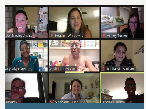
Over 20 hosted rooms made catching up at the virtual LAF 35th Annu<u>al Benefit a blast</u>

LAF and partners produced a special Knowledge@Wharton report to demonstrate the value of landscape solutions in climate change adapatation and mitigation efforts.